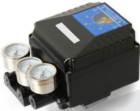
With Dome Indicator